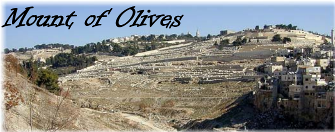
Mount of Olives