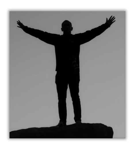
"NEW MAN" in CHRIST

Having been FREED from sin and enslaved to God. (Rom 6:22)