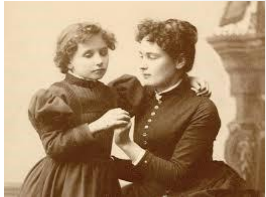
Helen Keller and Ann Sullivan