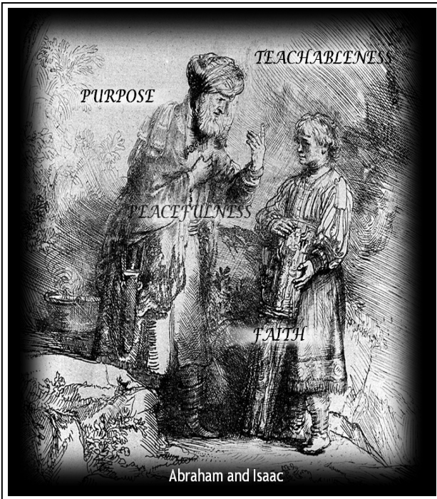
Rembrandt van Rijn

“And do not be conformed to this world, but be transformed by the renewing of your mind, so that you may prove what the will of God is, that which is good and acceptable and perfect.”